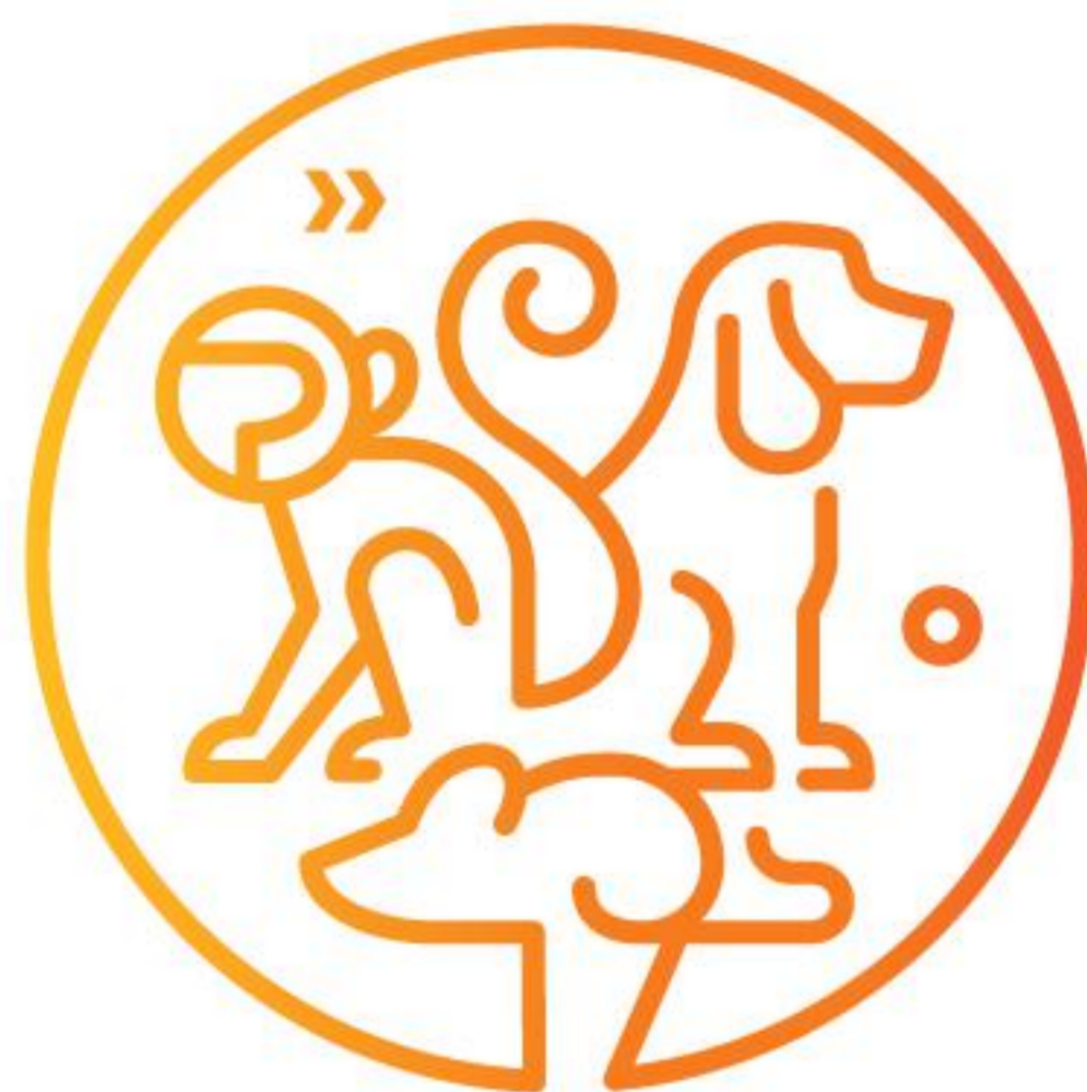
In Vivo Toxicology and Pharmacology