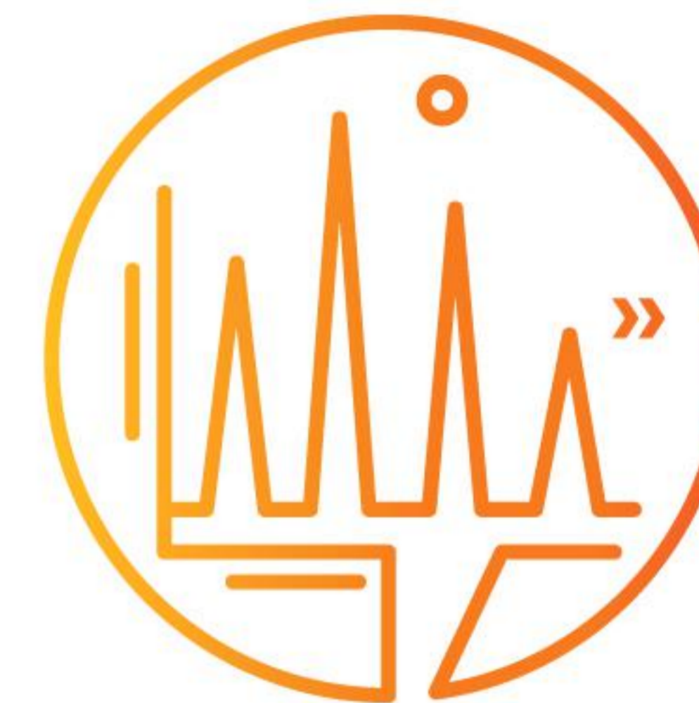
Drug Metabolism, Bioanalysis, and PK