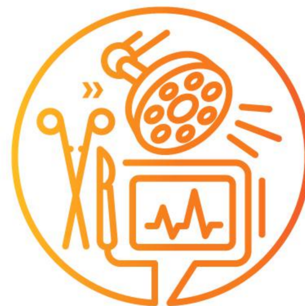
Surgical Models and Medical Device Testing