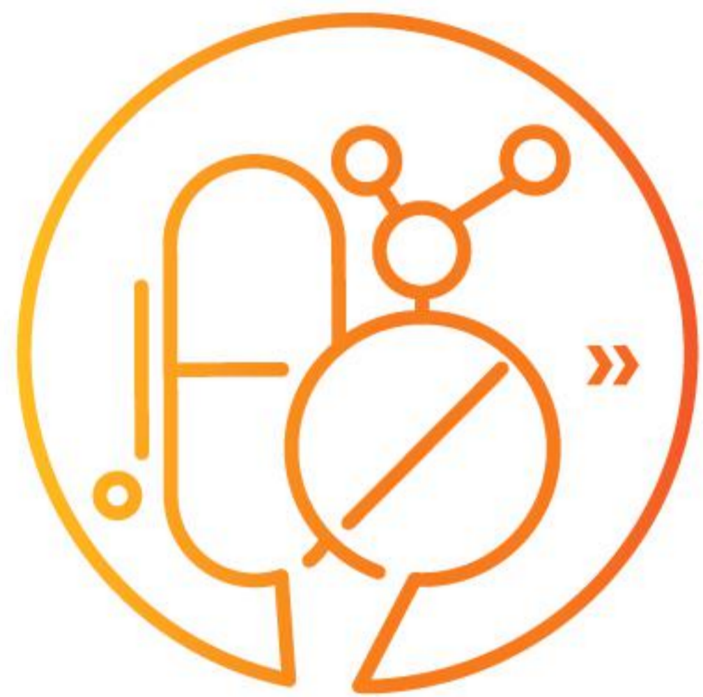
Discovery Through Approval

From first contact through completion, our proven process for efficient project execution ensures clear expectations, consistent communications, easy access to your scientific team, and quality results for: